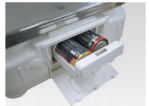
The battery box makes it quick and easy to replace batteries.